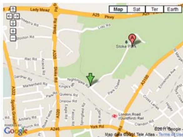
6.30am Location (Outdoors)

MAPS (Please go on to Google Maps using the postcodes above for full details)