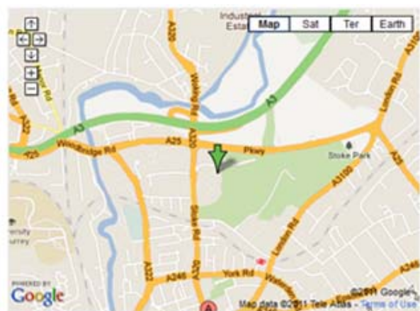
9.30 Location (Outdoors)